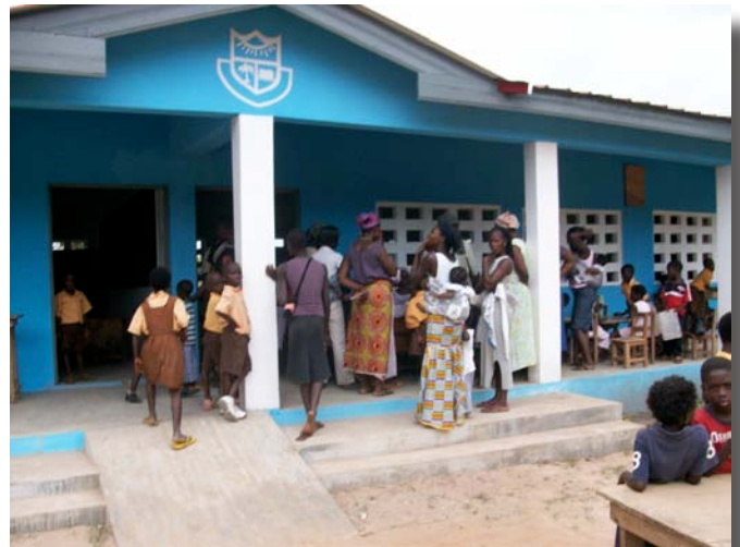
First Day of School at Nii Otto Kwame Primary